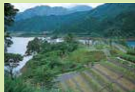
Toriibara Park area