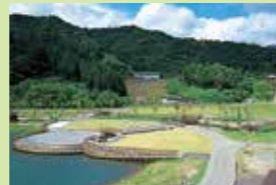
Miyagase Park area

Take a pleasure cruise around Miyagase Lake Tour boats will take you from the top of the dam to the Miyagase Park and Toriibara Park areas.