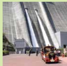
Miyagase Dam (discharge viewing area)